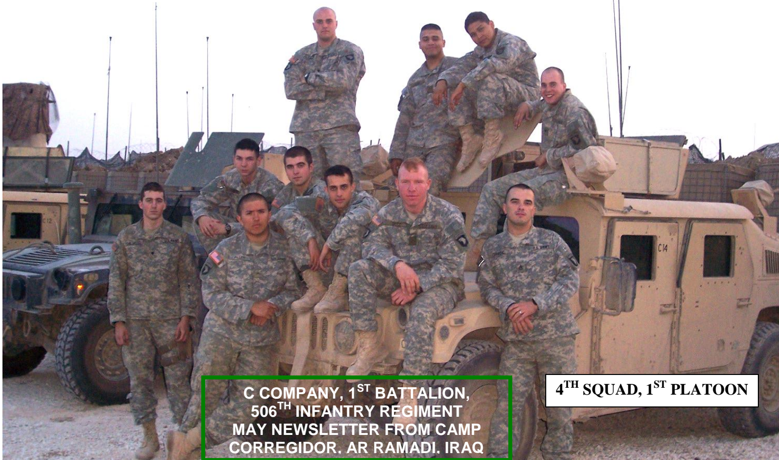
C COMPANY, 1 ST BATTALION, 506 TH INFANTRY REGIMENT MAY NEWSLETTER FROM CAMP CORREGIDOR, AR RAMADI, IRAQ