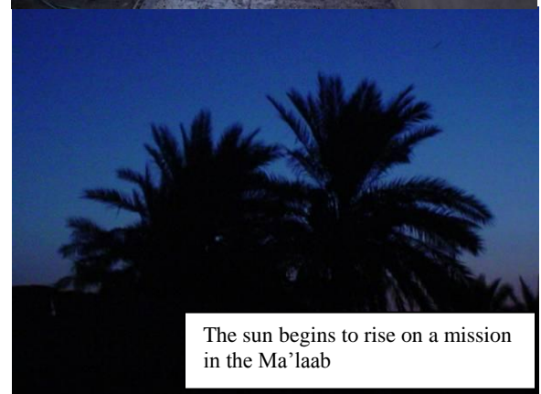
The sun begins to rise on a mission in the Ma'laab