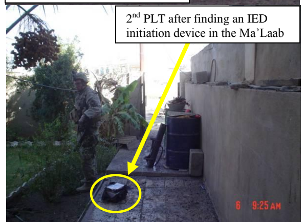
2 nd PLT after finding an IED initiation device in the Ma'Laab