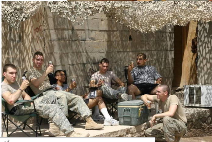
2 nd Squad relaxes out back of the "Shoot House."