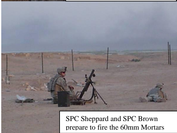
SPC Sheppard and SPC Brown prepare to fire the 60mm Mortars