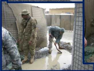
The HQ Section had to dig a trench to keep the office from flooding after the 1 st snow melt!