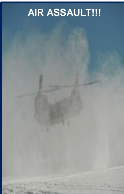
CH-47s land after a winter snow storm at FOB Boris