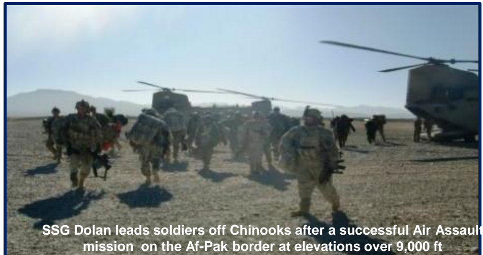
SSG Dolan leads soldiers off Chinooks after a successful Air Assault mission on the Af-Pak border at elevations over 9,000 ft