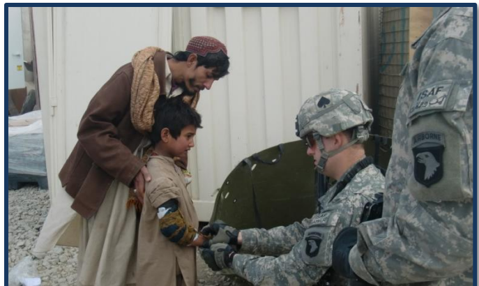
A Soldier examines a little boy's arm at the front gate before he is treated at the Orgun-E clinic.