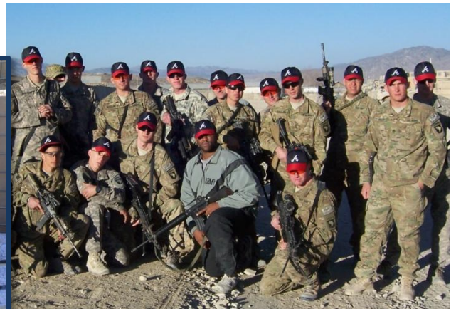
Go Braves! They sent us the hats. Tomahawk Chop!