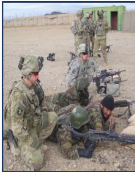
3 rd PLT Trains Afghan Soldiers

1 st Platoon has assumed combat operations in the COP Margah area and continues to drive the enemy across the border into Pakistan. On days off, Team Margah continues to improve and expand the living areas on the COP. 3 rd Platoon has begun combat missions out of FOB Boris. Fox Company recently conducted Operation Fox Hunt in mountains on the Af-Pak border at over 9,000 ft. The severe elevation and terrain is getting us in great shape. The views from these areas are amazing. The weather is starting to get cold, however, not as cold as our Range 52 days last year at Fort Campbell, KY.