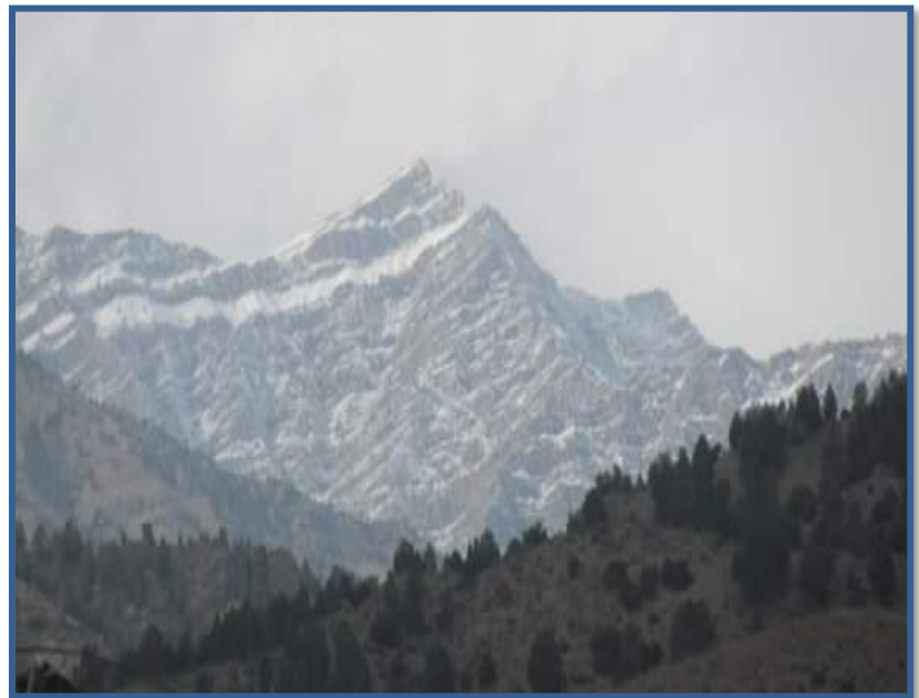
Snow cover on the summit from Zerok