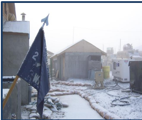
View from Whiskey Company's CP after our First Snow-Fall. There was no two-hour delay.