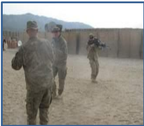
3 rd Platoon rehearse room clearing operations