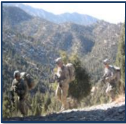
Weapons Squad, 1 st PLT on the Company Air Assault mission