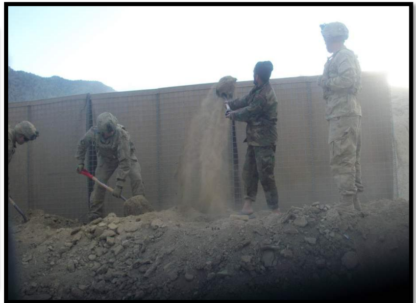
Dog Company Soldiers and our Afghan National Army partners fill seven foot HESCOs with shovels during the Walawas Border Control Point expansion at the end of January.