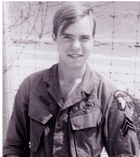
Photo taken of Art in February 1970 at the 93rd Evac Hospital in Da Nang .

In the aftermath of war, the country looks for ways to ease the pain and guilt for the miseries we inflicted upon ourselves. As a part of the healing process, cities, towns and villages build war monuments to publicly honor those that served. These monuments are not intended to glorify war but are instead necessary reminders that the true cost of protecting our freedom, or the freedom of the oppressed, is the highest cost, life itself. For without proper remembrance, the sacrifices and disruption of lives would be meaningless. That is why this war veterans cries.